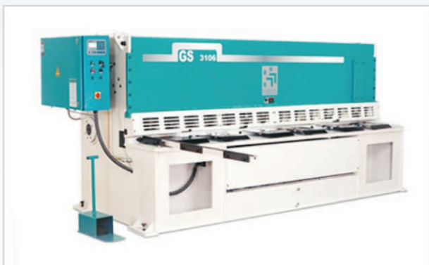
Hydraulic Shearing Machine