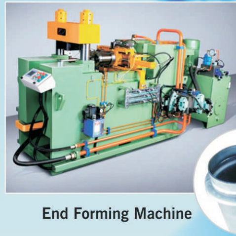
End Forming Machine